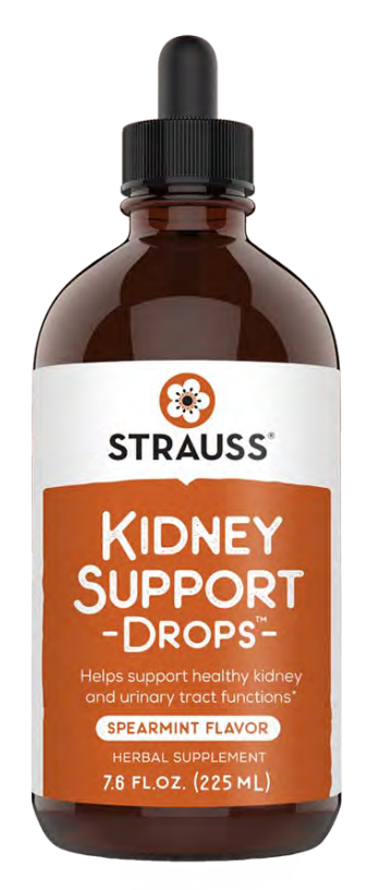
A blend of 12 herbs